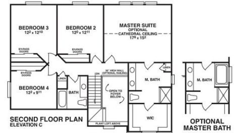
SECOND FLOOR PLAN ELEVATION C